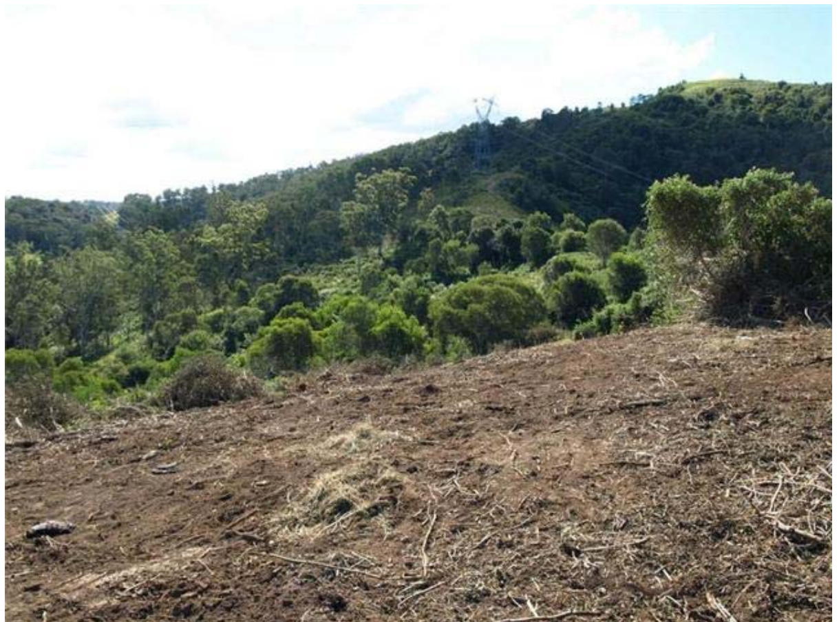
And looking south, towards the Bowl: