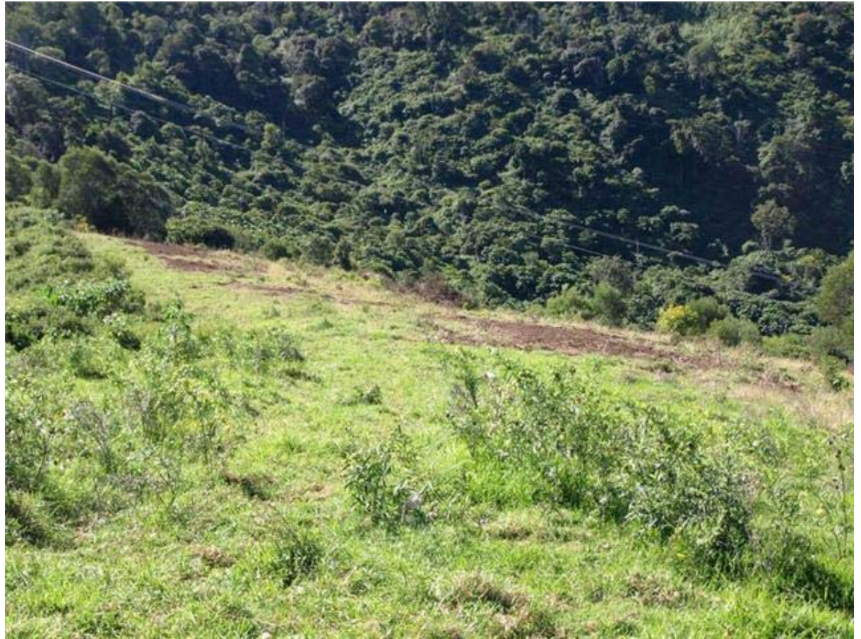
Looking north from the newly-cleared hilltop area: